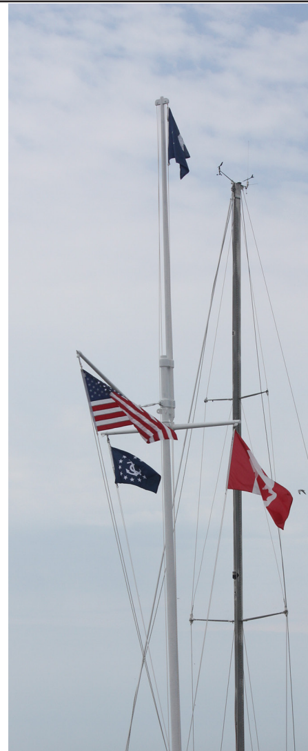
Above: Burgee back at top of flagpole once again thanks to member work. Well done.

The Basin Committee and I wish you a happy and safe boating season, and enjoy the Club!