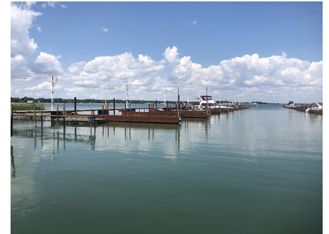
Above and below: photos from your Rear Commodore taken last week. a couple more on pages 6 and 7