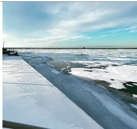
Above: New coating on berm held up to the first winter. Rest of page: work to restore the boat launch at Point Abino.

Dining Reservations—883-5900 Business Office—883-5900 Point Abino—905-651-7957